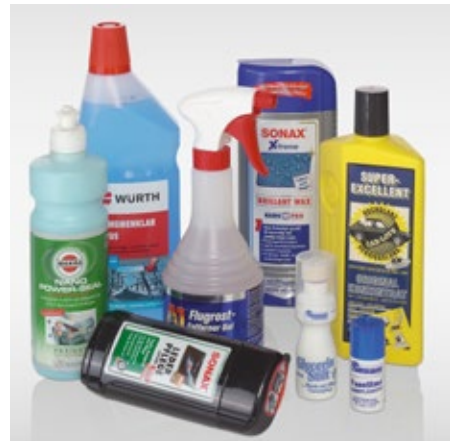
Offer a range of suitable items when the shop is closed.