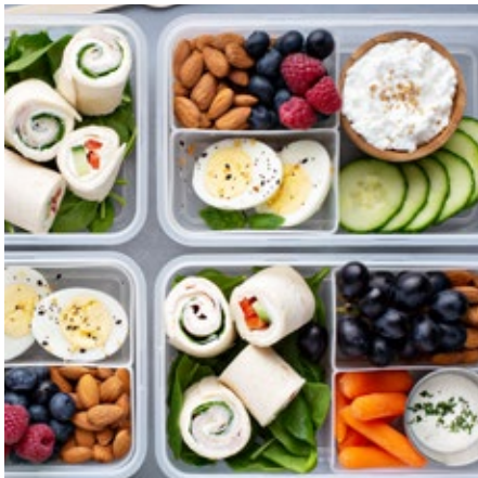
Seasonal fruit and vegetables can be dispensed e.g. or ready meals and more by the SiLine® Outdoor

*Dependant on site conditions there may be some variations, avoid direct sunlight