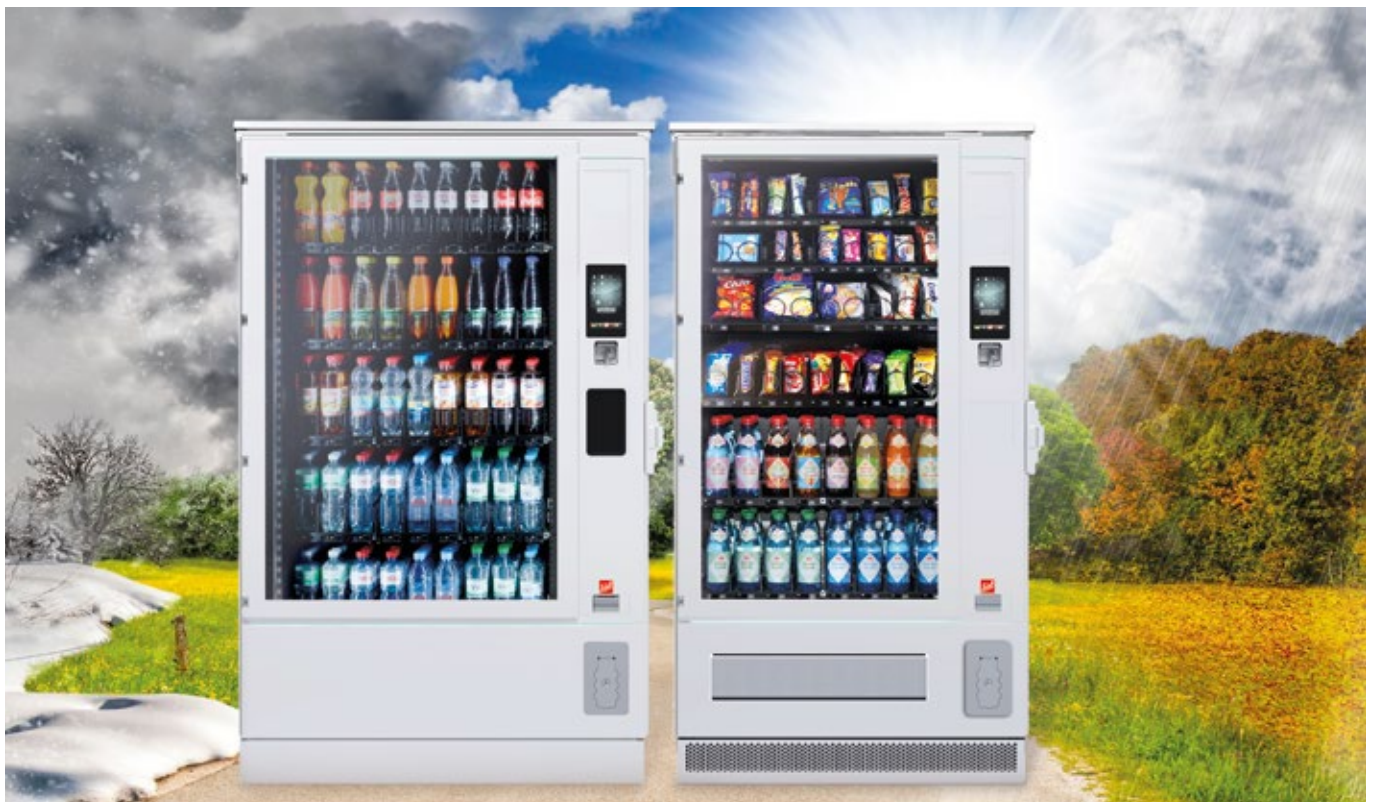
SiLine® GF L RO with standard Design Package A in Standard colour RAL 9010

SiLine® Outdoor – ready for all weathers, just provide electricity