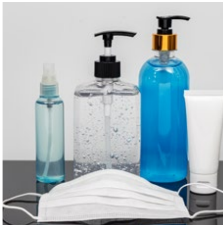
Sell both food and non-food goods, hygiene products etc.