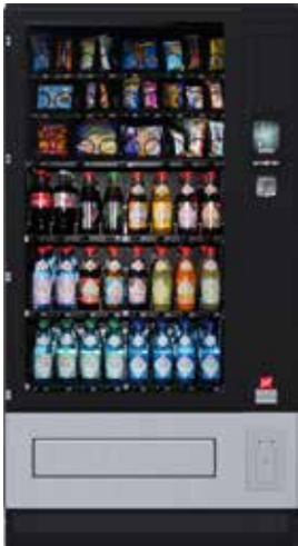
SiLine® Combi M RP VA