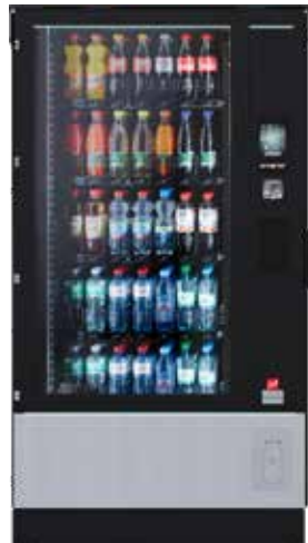
SiLine® GF M RP VA Design package A, high security frame