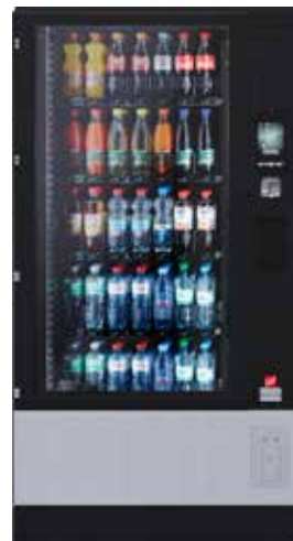
SiLine® GF M RP VA