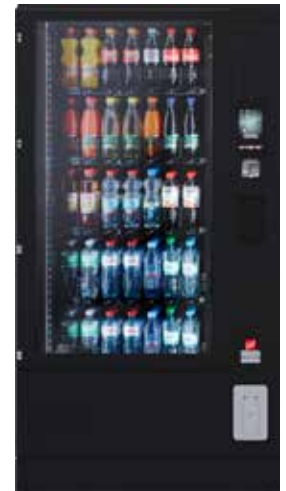
SiLine® GF M RP RA