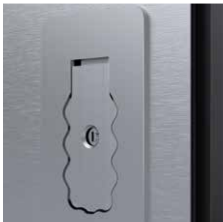
The wavy-shaped locking lever protection safeguards the SiLine® Public series from being levered or prised open