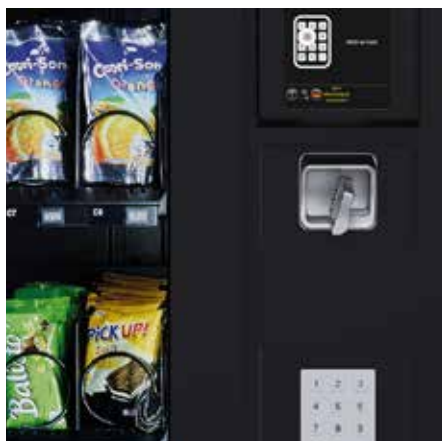
Optional extra for Snack and Combi: Impact protection cover in front of the touch display in combination with a metal keypad