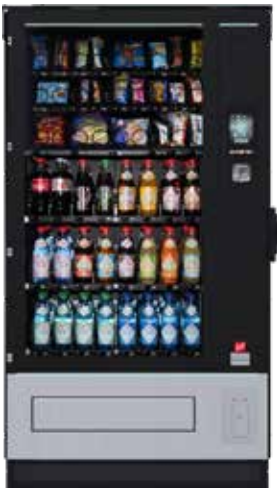
SiLine® Combi M RP VA Design package A, high security frame