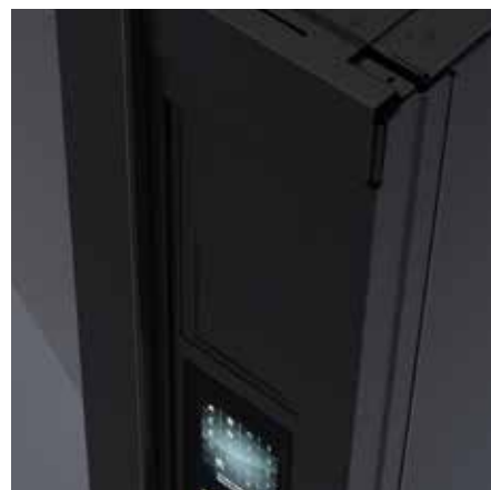
An all-around door split cover to prevent the housing being levered open