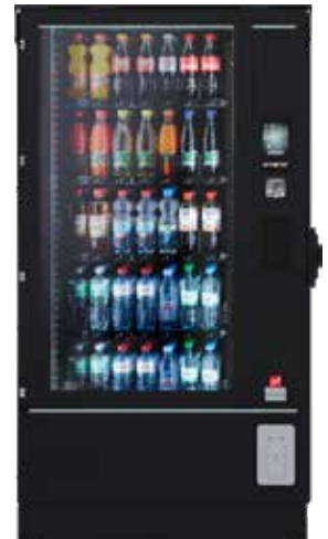
SiLine® GF M RP RA Design package A, high security frame