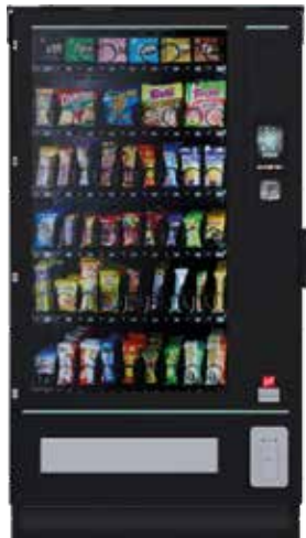
SiLine® Snack M RP RA Design package A, high security frame