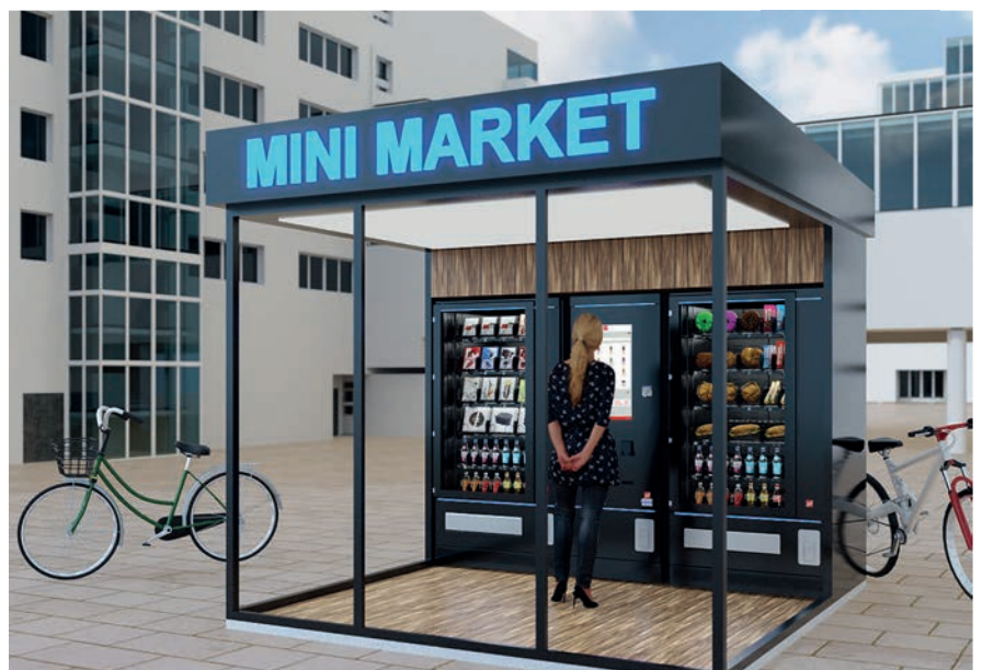
Plenty of additional service for orders and sales – smart shopping and payment at a single touchpoint for an improved and more convenient shopping experience