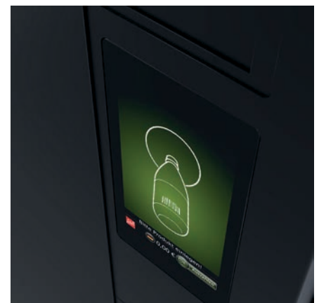
The intuitive touchscreen is easy for customers and staff to operate