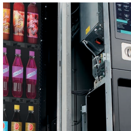
Convenient and clear handling: The technology behind the SiLine® series