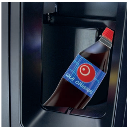
Virtually no shaking during transport to product delivery

For detailed information and exact data for the individual vending machines, refer to the individual brochures and the data to download at www.sielaff.de .