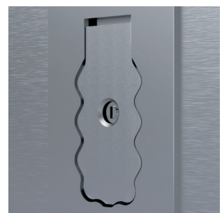
The wavy design of the locking lever protection system ensures that the SiLine® Series cannot be prised or levered open