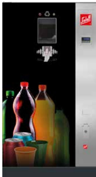
SiOne EB (Design A "colour explosion", bottles/cans/cups, multi-colour)