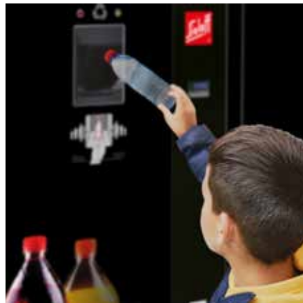
Straight forward and secure return process