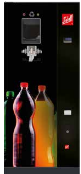
SiOne Small RB (Design C "colour explosion", bottles, multi-colour, operator panel painted in door colour)