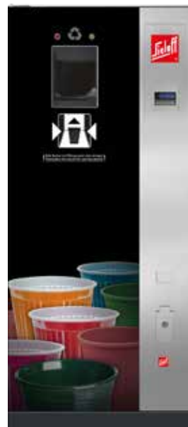
SiOne Small EB (Design B "colour explosion", cups, multi-colour)