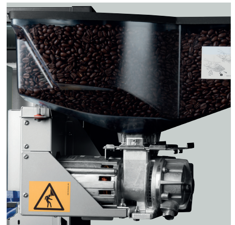
High-quality components from the HoReCa range