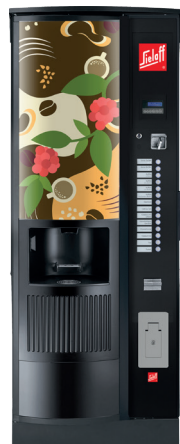
CIS/ CVS 500 RB RO Design C