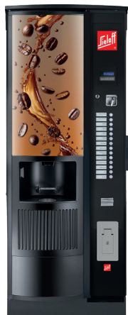
CIS/ CVS 500 RB RO Design B