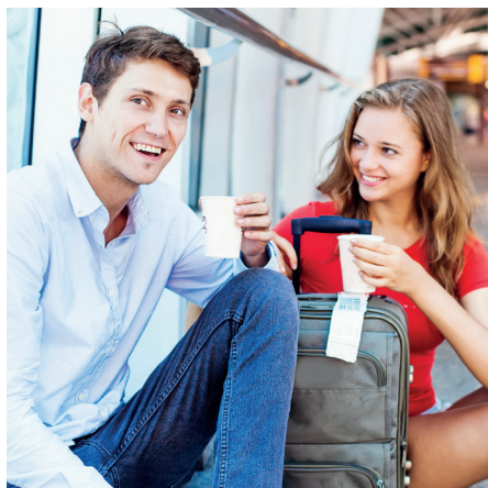
Perfectly and individually tailored to different requirements

The result: an outdoor hot drinks machine which not only serves excellent coffee, but also demonstrates exceptional reliability and safety – 24/7, all year round.