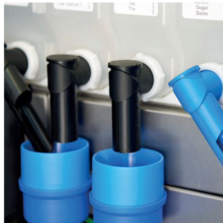
Can be customised thanks to the wide range of variants