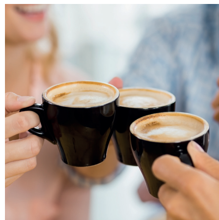
The excellent coffee quality and wide variety of products are second to none