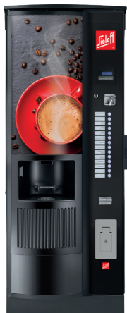
CIS/ CVS 500 RB RO Design A